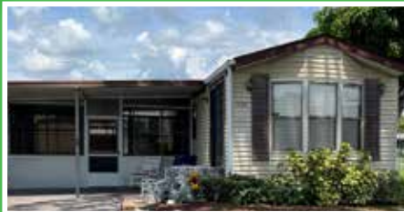
5154 Oakland Hills Ave. $105,000 480 sq. ft., 1 bed, 1 bath