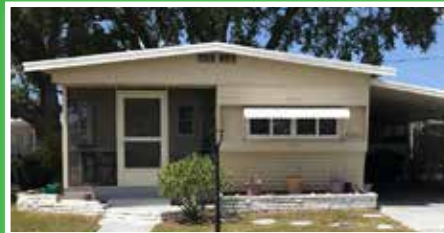
4745 Winged Foot Ave. $218,000 1248 sq. ft., 2 beds, 2 baths