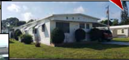
1628 Old Elm $128,900