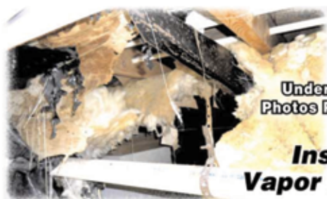
Underhome Photos Provided

Insulation Under Your Home Falling Down? Holes and Tears in Your Vapor /Moisture Barrier?