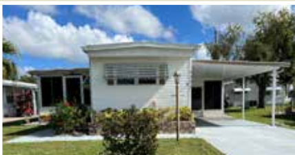
5318 Bel Air Ave - $171,500 2 beds, 2 baths, 864 sq ft