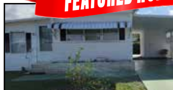
1766 Palm Springs $124,900