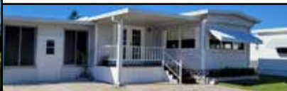
1607 Midlothian $179,900