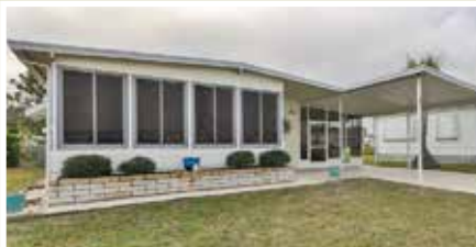
1882 Brook Field Ter - $198,500 2 beds, 2 baths, 1008 sq ft