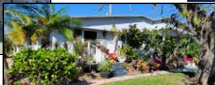
1627 Midlothian $140,000