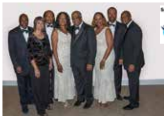
A Motown Revue with Soul Sensations