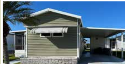
5237 Beechmont Ave - $139,000 2 beds, 2 baths, 672 sq ft