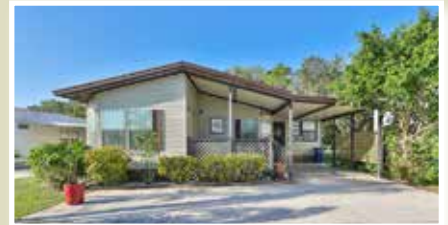
5001 Brae Burn Ave - $235,000 3 beds, 2 baths, 1,443 sq ft