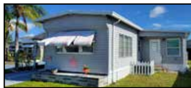
5242 Pebble Beach $164,900.00