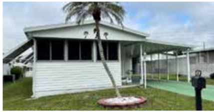
1639 Olympia Fields - $160,000 2 beds, 2 baths, 820 sq ft