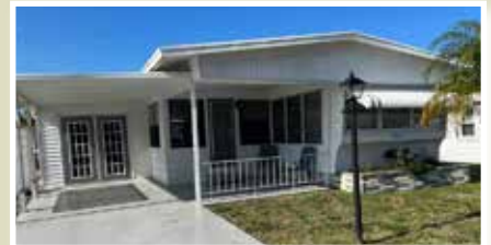
5043 Boca Raton - $165,000 2 beds, 1 bath, 1,074 sq ft