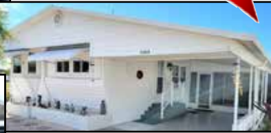
5203 Oakland Hills $179,900