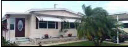
5219 Cherry Hill SOLD