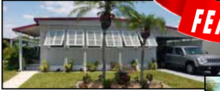
5242 Glen Echo SOLD