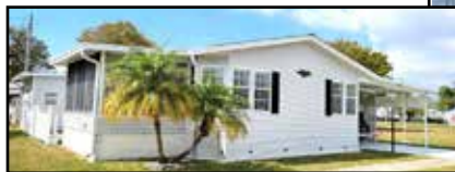
5297 Tri Par Dr. $224,900