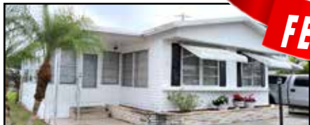
4920 Boca Raton $159,900