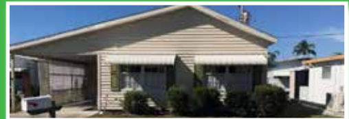
1735 Old Elm St. $155,000