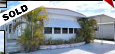
5238 Cherry Hill $174,900