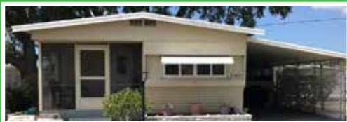
5103 Pebble Beach Ave $145,000