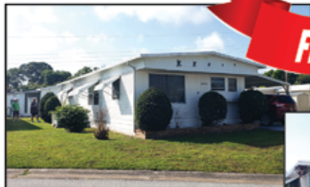
1628 Old Elm $128,900.00