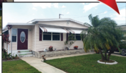
5219 Cherry Hill $142,900.00