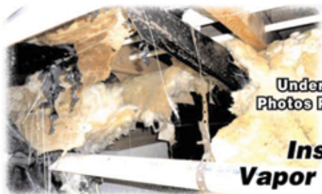
Underhome Photos Provided

Insulation Under Your Home Falling Down? Holes and Tears in Your Vapor /Moisture Barrier?