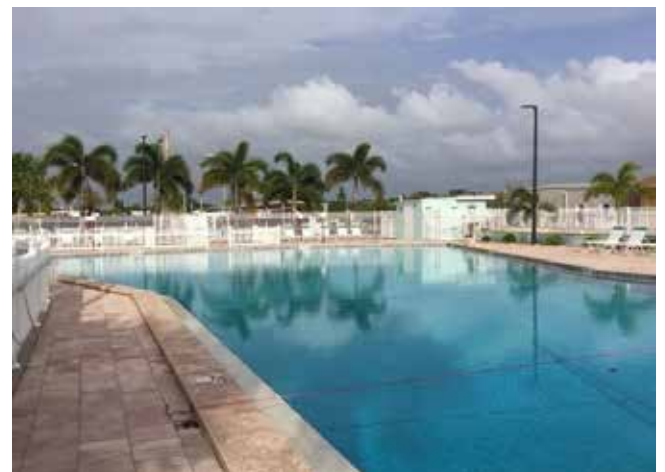
Water added – Pool is waiting for you! (Come on back and enjoy the Pool & Tiki Hut!!!)