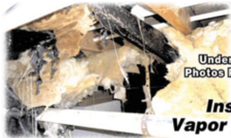
Underhome Photos Provided

Insulation Under Your Home Falling Down? Holes and Tears in Your Vapor /Moisture Barrier?