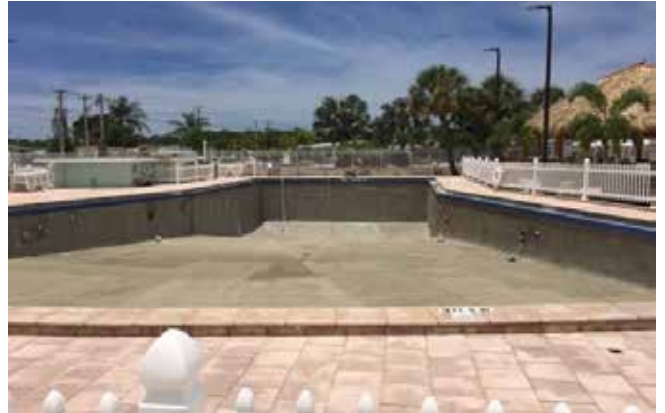
This picture shows how it looked during construction. (Empty and lonely).

We are happy to say the TRI-PAR POOL is OPEN! Hip Hip Hurray!