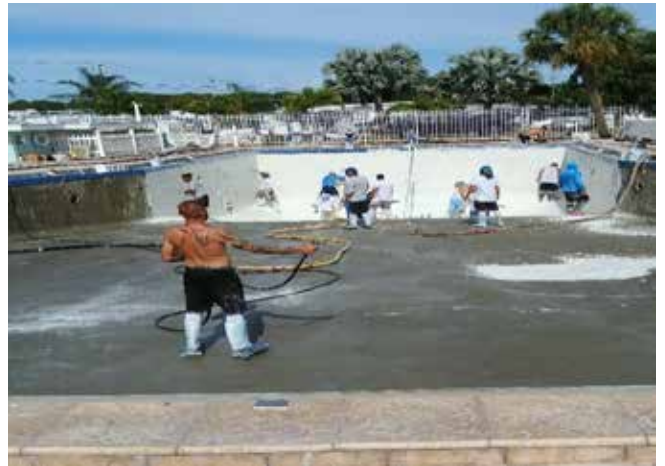
The workers putting the finishing on. (Next step ----- add water!)