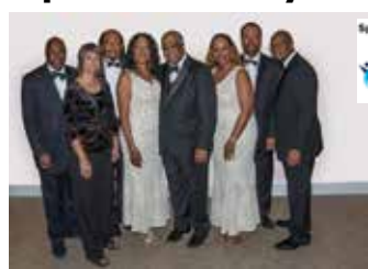
A Motown Revue with Soul Sensations