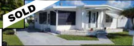
5126 Bel Air Ave - SOLD