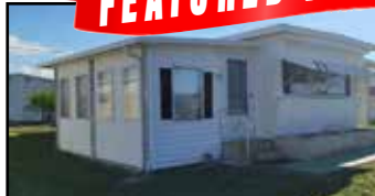
1566 Palm Springs $139,900