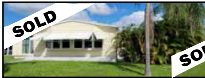
1875 Woodstock - SOLD