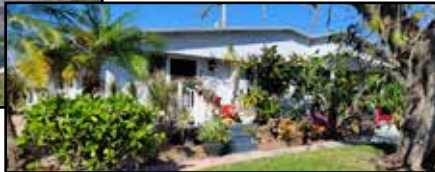
1627 Midlothian $160,000