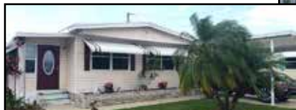
5219 Cherry Hill $136,900