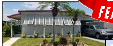
5242 Glen Echo $149,900