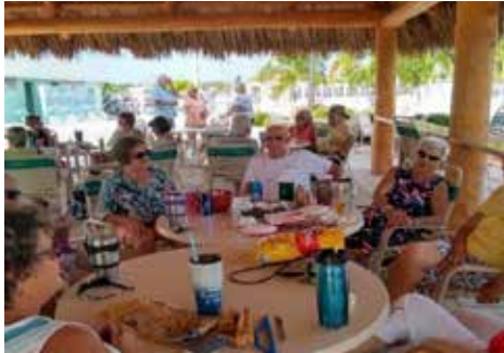
IF IT'S RAINING, IT'S CANCELLED

All residents are included. This is BYOB (bring your own beverage) and snacks. No glass, plastic items only. Stay longer than 6:00 p.m. if you'd like to.