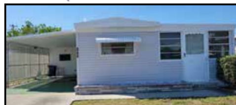
1877 Palm Springs - $169,900 2 Bedroom, 1.5 Bath - 859 sq ft.