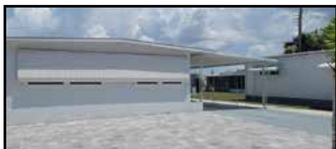
4714 Tri Par Dr • $173,000 2 Bedroom, 2 Bath - 864 sq ft.