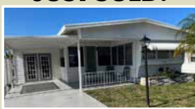
5043 Boca Raton 2 beds, 1 bath, 1,074 sq ft