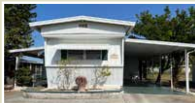
1871 Palm Springs St - $110,000 2 beds, 2 baths, 696 sq ft