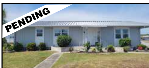
5135 Glen Echo • PENDING 2 Bedroom, 2 Bath - 1116 sq ft.