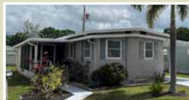
1706 Old Elm St - $140,000 2 beds 2 baths, 704 sq ft