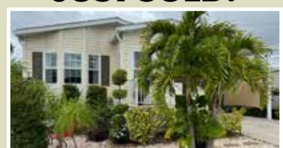
5006 Sea Island Ave. 2 beds, 2 bath, 1,344 sq ft