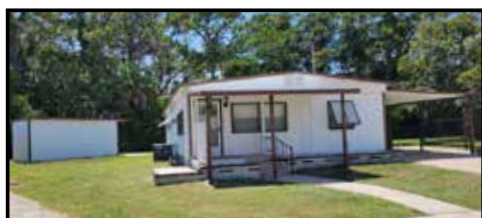
5337 Boca Raton • $198,900 2 Bedroom, 2.5 Bath - 1104 sq ft