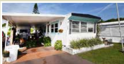
5241 Pebble Beach Ave - $99,000 1 bed, 1 bath, 552 sq ft