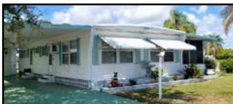
4900 Oakland Hills • $178,900 2 Bedroom, 1.5 Bath - 980 sq ft.