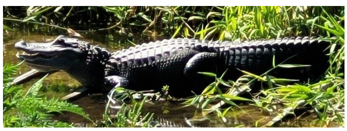
Please obey the signs and don't feed the wildlife especially the alligator(s). Also, the coyotes are still in and around Tri-Par. Pets should be kept on a short leash and observed while in your yard. Keep at a distance and <u>do not feed</u> any wildlife!