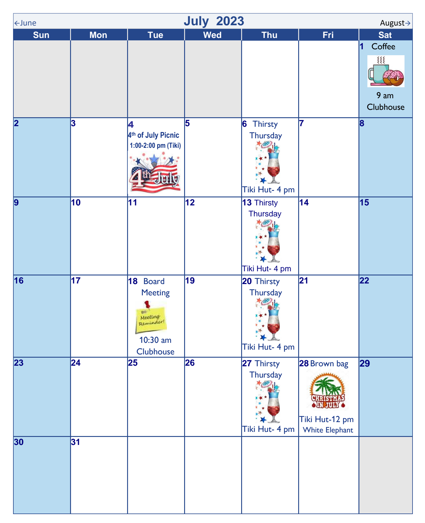
<u>All scheduled events are tentative and may be postponed or cancelled.</u> Physical Distancing, number of people allowed in groups, and guidance from our advisors, may factor in the decision whether an event is held. Please check TV Channel 196 or our website for Updates. Tri-Par thanks you for your understanding.