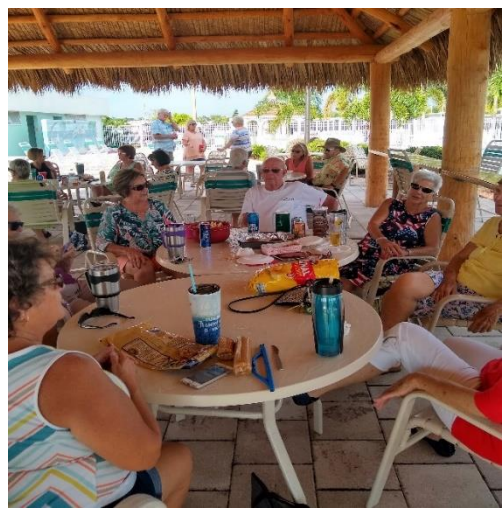
IF IT'S RAINING, IT'S CANCELLED

All residents are included. This is BYOB (bring your own beverage) and snacks. No glass, plastic items only . Stay longer than 6:00 pm if you'd like to.