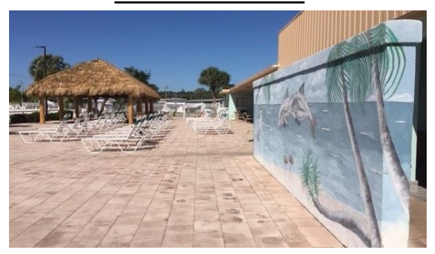
Music, Dancing and Fellowship A Great Place to Be at Low Expense Come Join Us for Some Fun!

Every Saturday - 4:00 pm to 10:00 pm On the Pool Deck