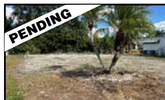
4820 Calumet - $45,000 Vacant Lot - 51 X 105 Lot Size