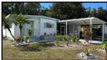
5025 Brae Burn - $148,900 2 Bedroom - 2 Bath - 976 Sq Ft