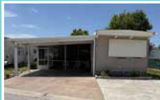
4819 Sea Island, $119,000 2 beds, 1 bath, 915 sq ft