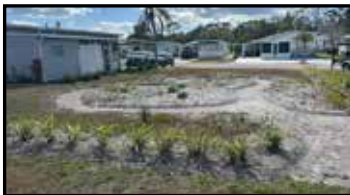
5254 Pebble Beach $59,900 Vacant Lot - 50 X 72