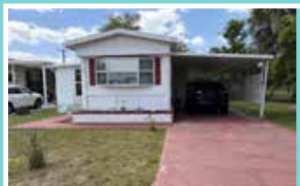
4833 Boca Raton, $79,900 2 beds, 1 bath, 672 sq ft