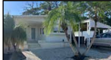
5325 Boca Raton - $156,900 2 Bedroom - 1.5 Bath - 780 SqFt