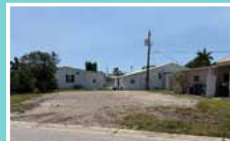
4913 Oakland Hills Ave, $49,000 Vacant Lot 53' x 76' 4188 sq ft