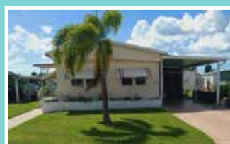
5229 Bel Air Ave, $149,000 2 beds, 2 baths, 1,060 sq ft