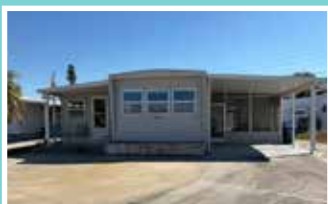
1862 Palm Springs St, $157,000 2 beds, 2 baths, 924 sq ft