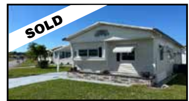
1709 Olympia Fields - SOLD 2 Bedroom - 1.5 Bath - 900 sq ft