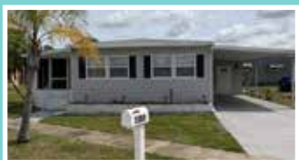
5308 Tripar Dr, $179,000 2 beds, 1.5 baths, 800 sq ft