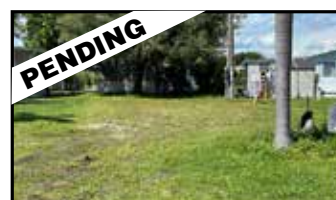
4812 Boca Raton - $29,900 Price Reduced - Vacant 51 X 76 Lot Size