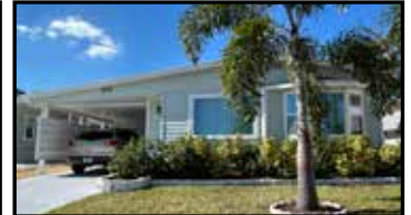
5313 Boca Raton - $169,000 2 Bedroom - 2 Bath - 1032 SqFT