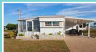
1580 Blind Brook Dr, $169,000 2 beds, 1.5 baths, 780 sq ft.