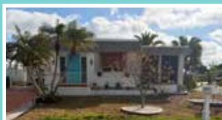
5214 Beechmont Ave, $180,000 2 beds, 2 baths, 1,060 sq ft.