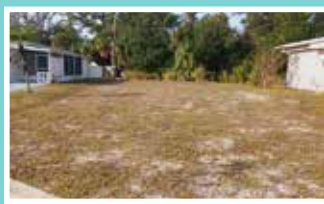
5267 Boca Raton Ave, $65,000 Vacant Lot, NOT in flood zone