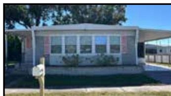
4775 Tri Par Dr - $198,900 2 Bedroom - 2 Bath - 1108 Sq Ft