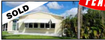
1875 Woodstock SOLD