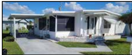
5126 Bel Air Ave $172,000