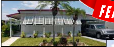
5242 Glen Echo $149,900