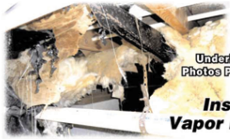
Underhome Photos Provided

Insulation Under Your Home Falling Down? Holes and Tears in Your Vapor /Moisture Barrier?