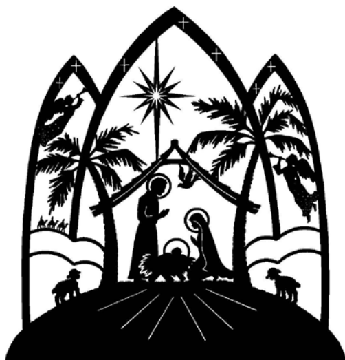
A silent night, a star above, a blessed gift of hope and love.