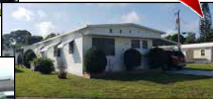
1628 Old Elm $128,900