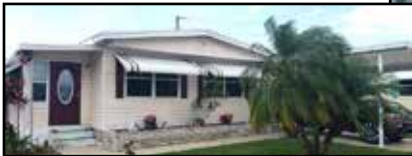
5219 Cherry Hill $136,900