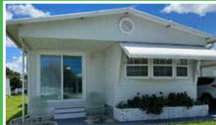
5114 Ranchero Ave. 1480 sq. ft., 21 beds, 2 baths