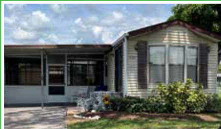
5154 Oakland Hills Ave. 480 sq. ft., 1 bed, 1 bath