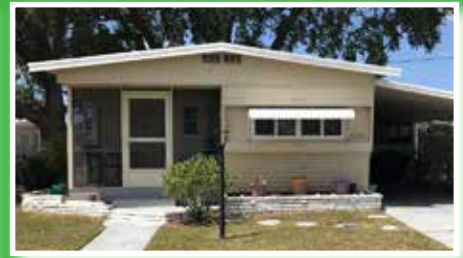
5103 Pebble Beach Ave $130,000 750 sq. ft., 2 beds, 1.5 baths